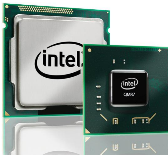
4th Generation Intel Two Chip Solution

represent a 13-15% performance improvement over the previous generation which was already a 10% improvement over its predecessor. Therefore, the 4th Generation Core processors provide a 25% overall gain over the Core processors that were considered mainstream just over 12 months ago while at the same time using far less power.